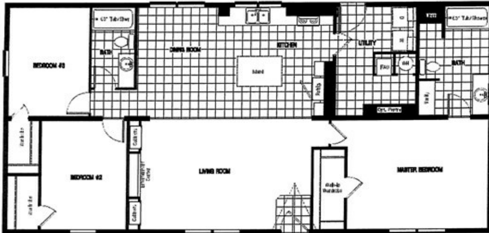
DREAM - 562F THREE BEDROOM, TWO BATH, FAMILY ROOM - 1512 SQ. FT.